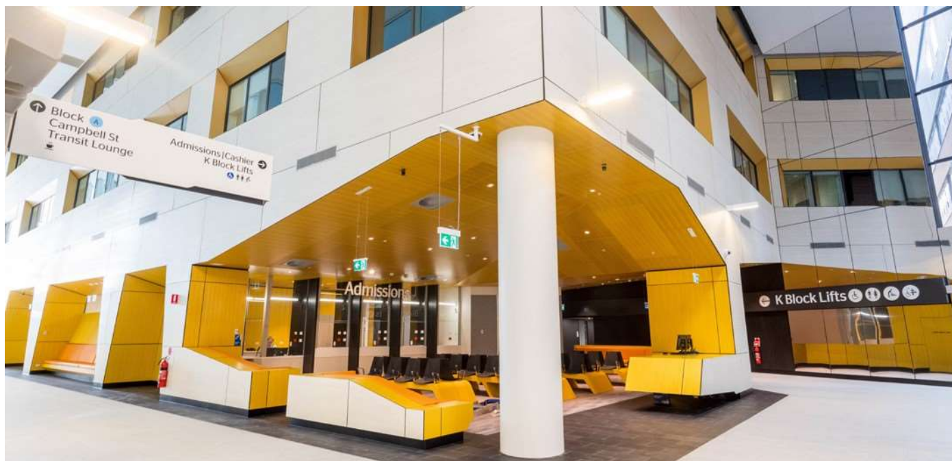
Admissions Area on Ground Floor of K-Block