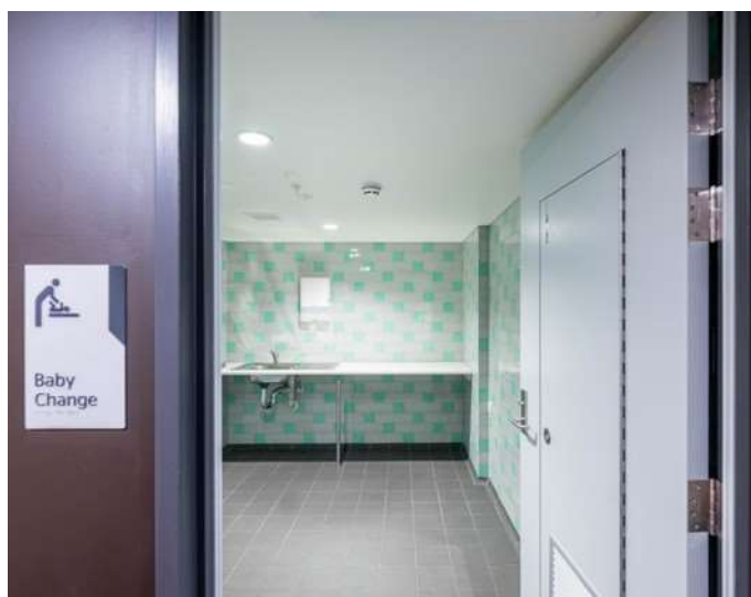
Parent Room on Ground Floor of K-Block