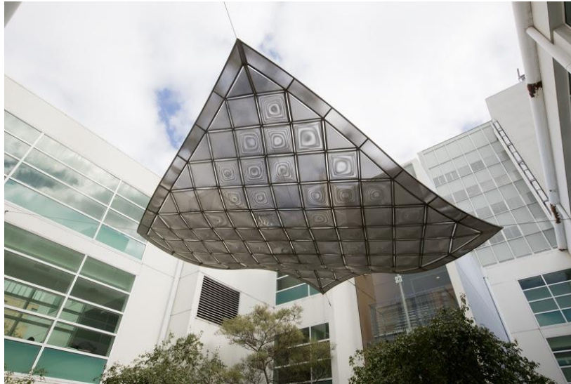
Patrick Hall, Quilt , 1999

24 October – 7 November 2016, Level 1 and 2, link-way between A and B-Blocks