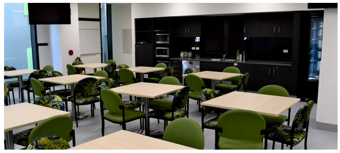
K5E staff room