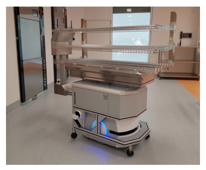
Lynx robotic automated guided vehicle robot

The CSD reception, staff offices and stair access to the theatres are also on K5E.