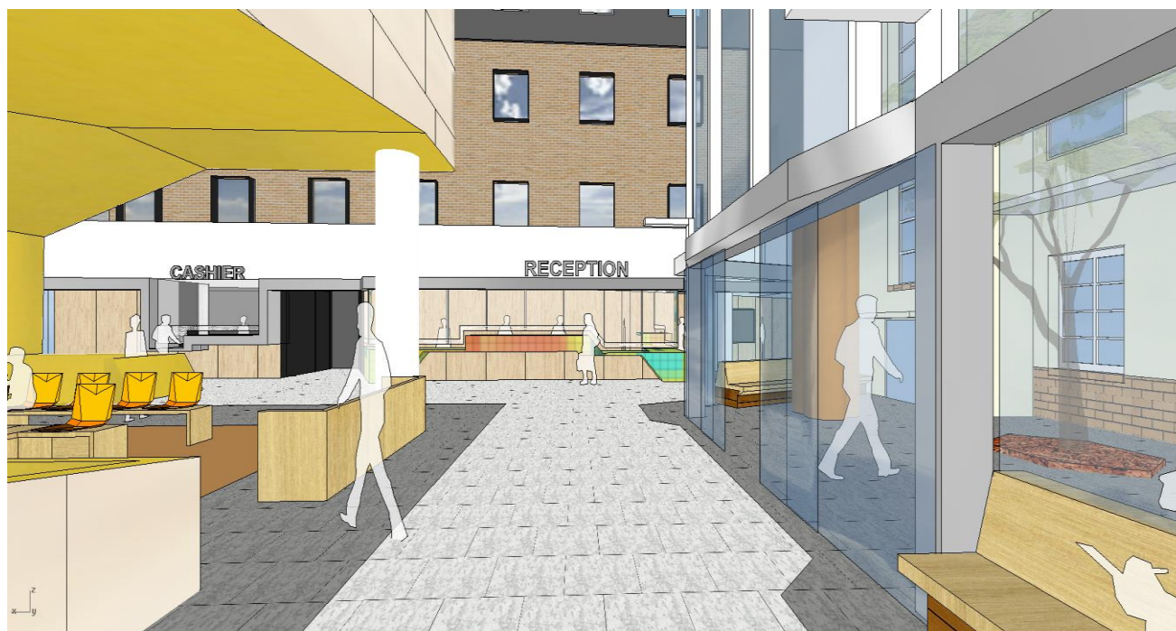
Interior design – view to admissions and reception on the ground floor

The CSD has a dedicated state-of-the-art loan equipment room, electronic instrument tracker and robot that will take instrument trays to the steriliser.