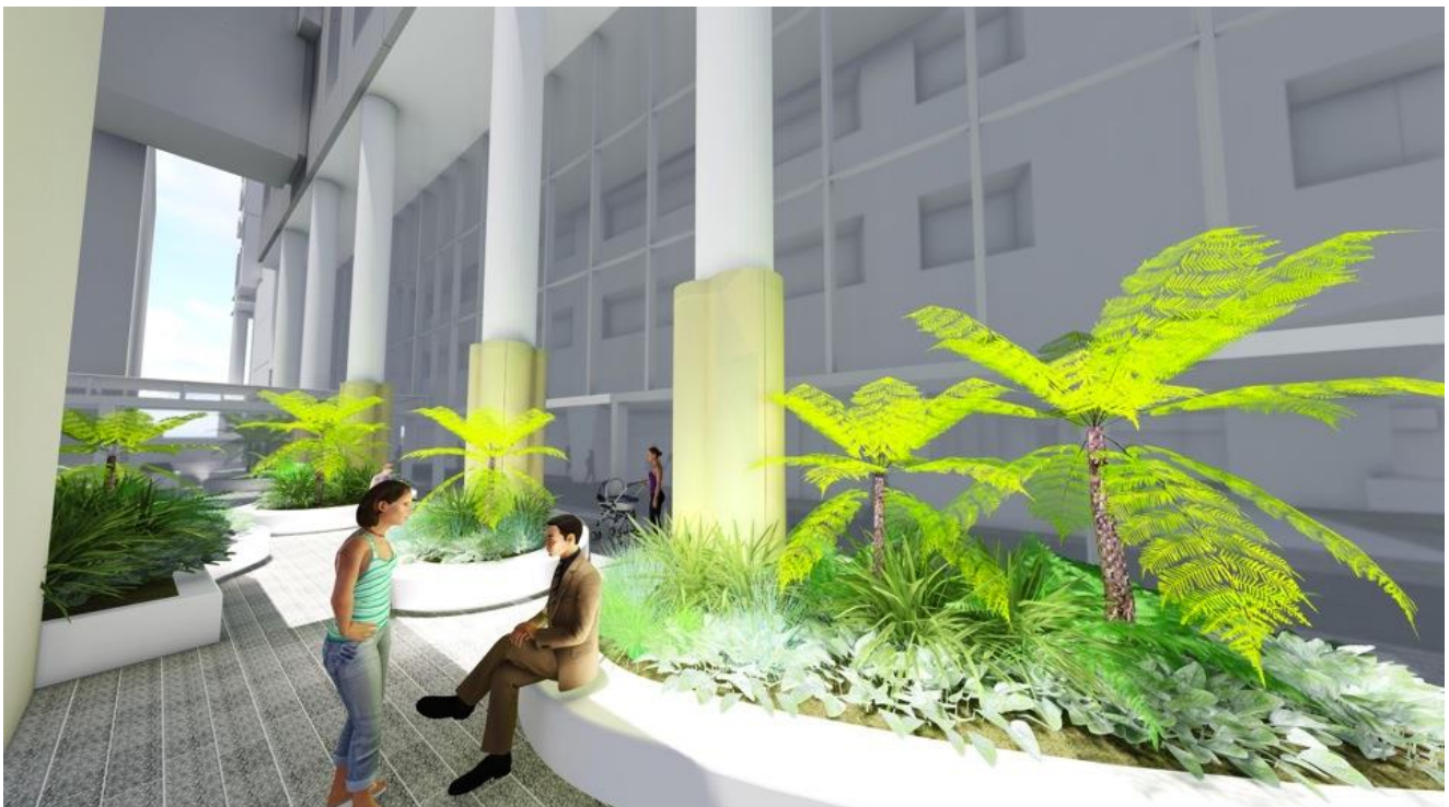
Ground floor landscaped outdoor terrace.

The façade's grid of panels is reminiscent of the Rajah Quilt, hand sewn by female convicts on their voyage to Van Diemen's Land in 1841.