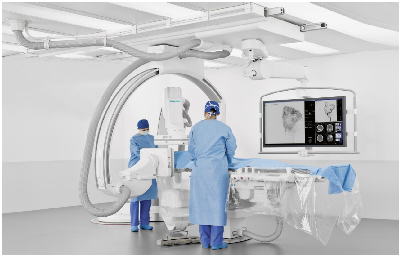
Artis Q biplane for the angiography suite